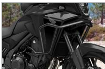
Upper Fairing Guard