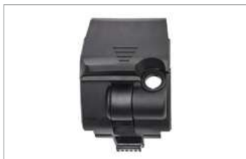
Top Case Lock